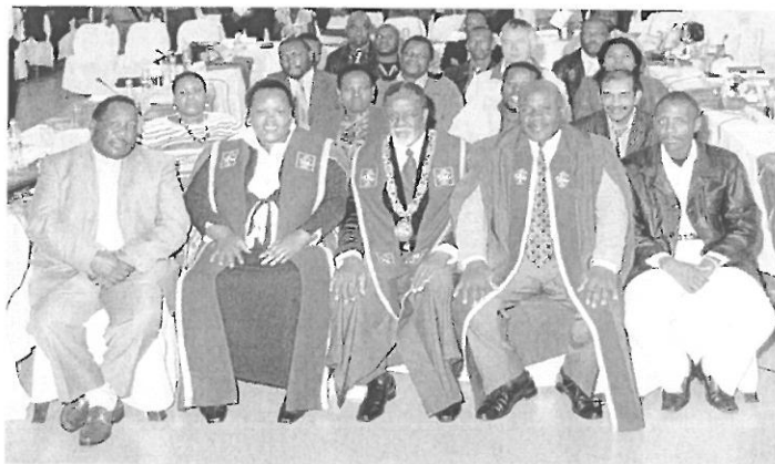
uMshwathi Municipal Council