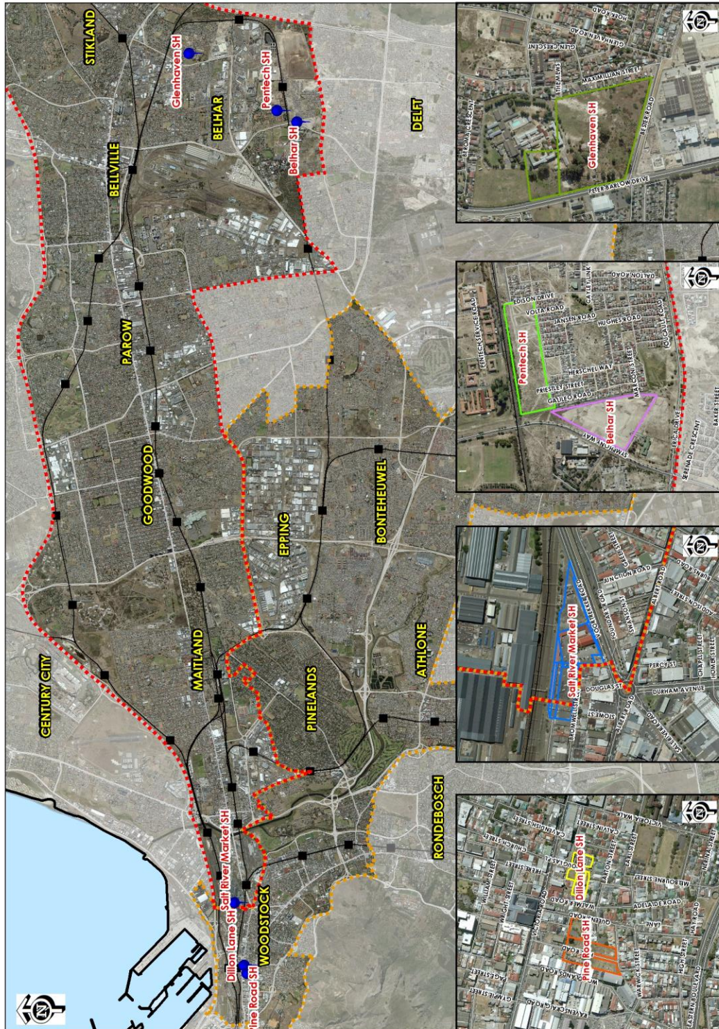
Map showing location of Social Housing Projects (existing and proposed)

integrated settlements where communities are in close proximity to public transport, employment and social amenities can be realised. Social housing where rental accommodation is managed in perpetuity for lower income households is a key part of this regeneration drive.